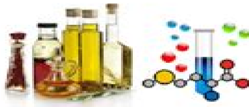
Food application (production of vinegar, oil, edible coatings, and bioactive compounds)