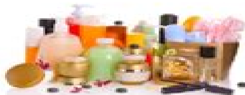
Cosmetics, pharmaceuticals, and chemicals products