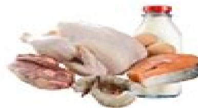
Meat, dairy, fish, and egg by-products