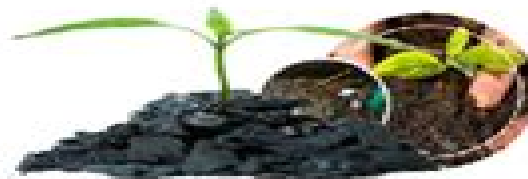
Plant nutrition application (organic fertilizer and biochar)