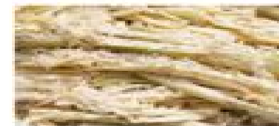
Sugar production by-products