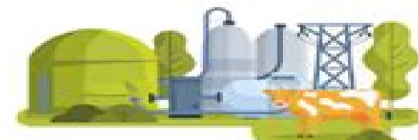
Biogas production application