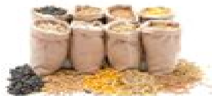
Cereals, nuts, and seeds by-products