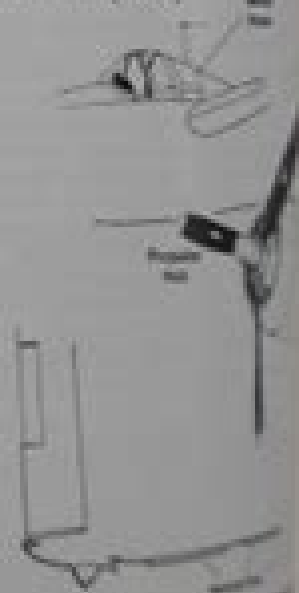
(Left) The propeller spinners were deleted early in production due to performance improvement and were not required for cooling. (Right) Late model aft fuselage were incorporated on all models.