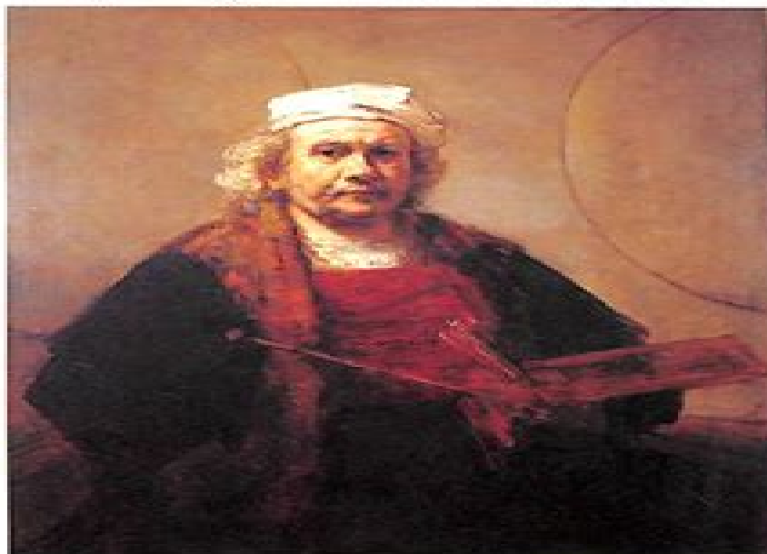
Self-portrait, Rembrandt, c.1665