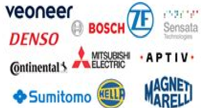
Notable Emerging Companies in Automotive ECU Market