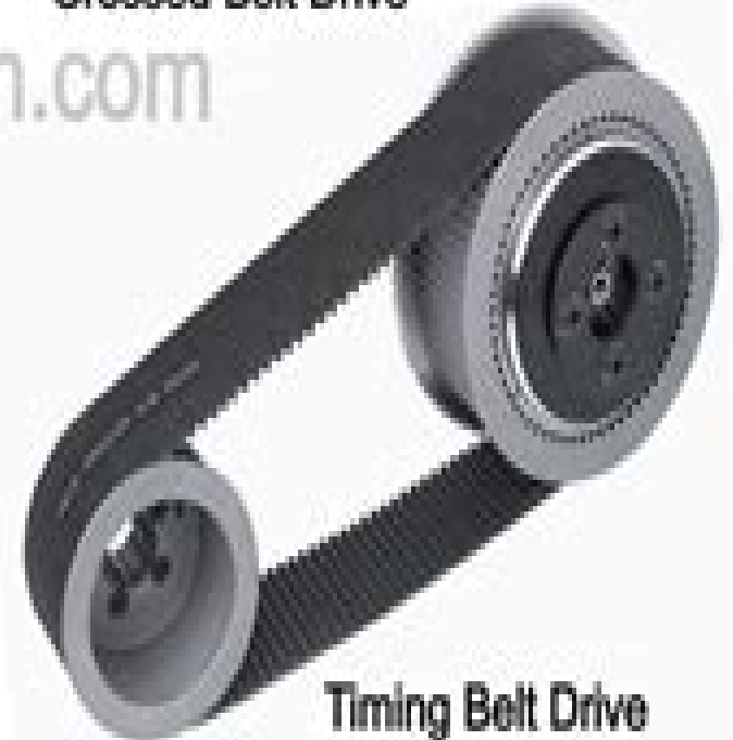
Timing Belt Drive