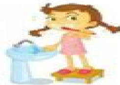
BRUSH MY TEETH