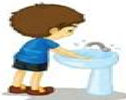
WASH MY FACE