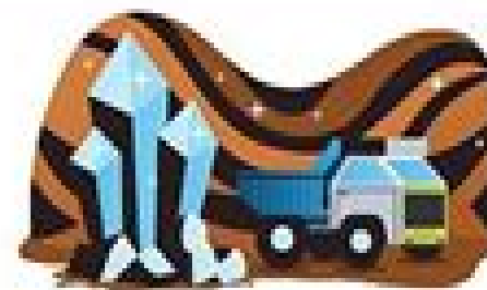
Precious Metals, Minerals, Roc