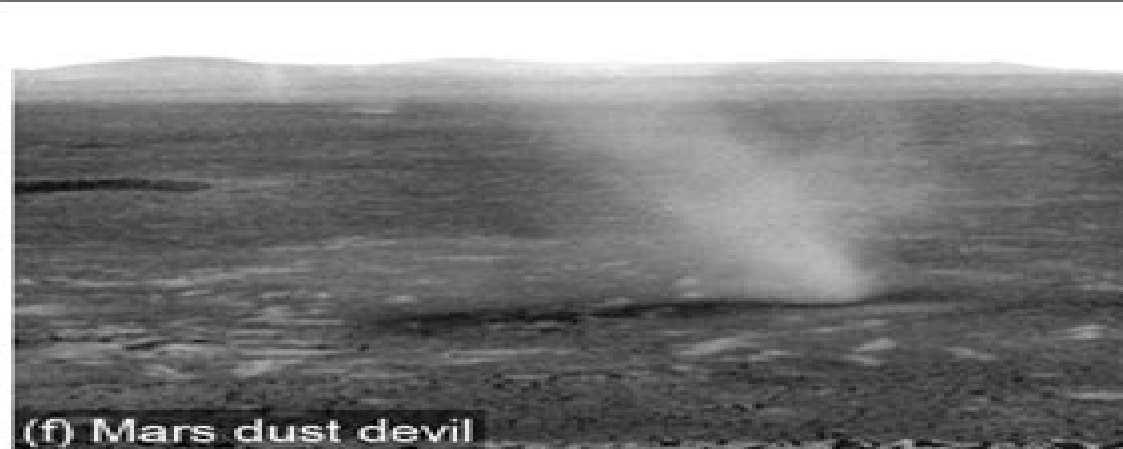
(f) Mars dust devil