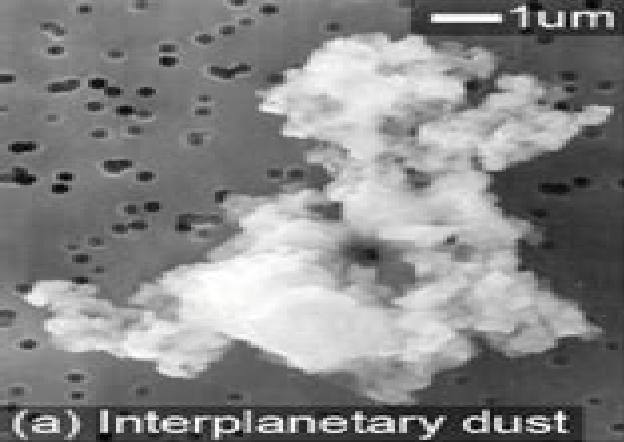
(a) Interplanetary dust