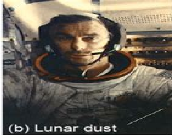
(b) Lunar dust