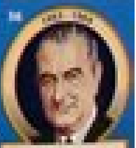
Lyndon B. Johnson