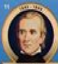
James K. Polk