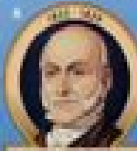
John Quincy Adams