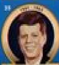
John F. Kennedy