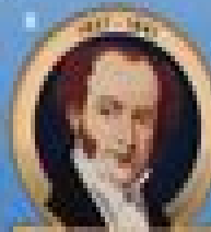
Martin Van Buren