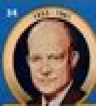
Dwight D. Eisenhower