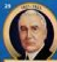
Warren G. Harding