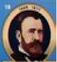
Ulysses S. Grant