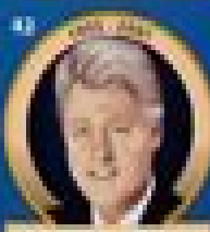
William Jefferson Clinton