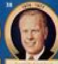
Gerald R. Ford