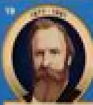
Rutherford B. Hayes