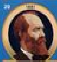
James A. Garfield