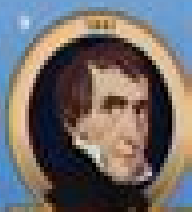
William Henry Harrison