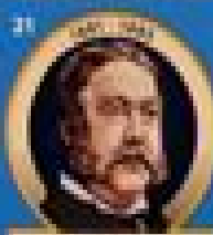
Chester A. Arthur