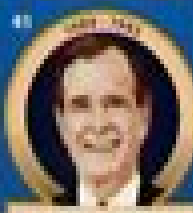
George H. W. Bush