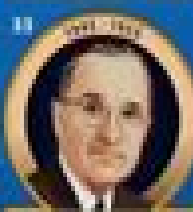
Harry S. Truman