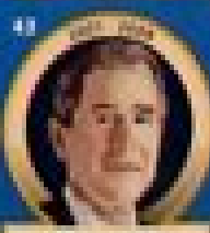
George W. Bush