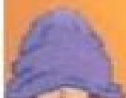
el trapero trapero