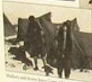
Mallory and Irvine (possibly) lying 15,000 feet above sea level