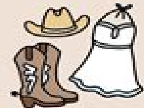
Pisces Coastal cowgirl