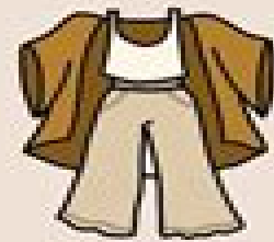
Cancer Casual comfort