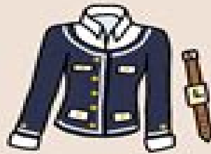
Taurus Old money