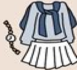
Virgo Country club classic