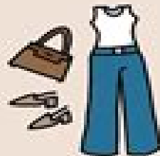
Capricorn Quiet luxury