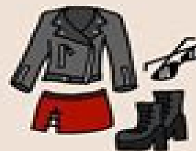
Aquarius Rock star girlfriend