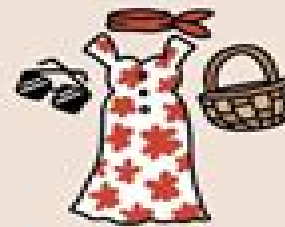
Libra Tomato girl aesthetic