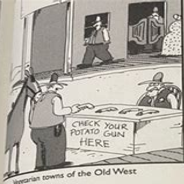
Vegetarian towns of the Old West