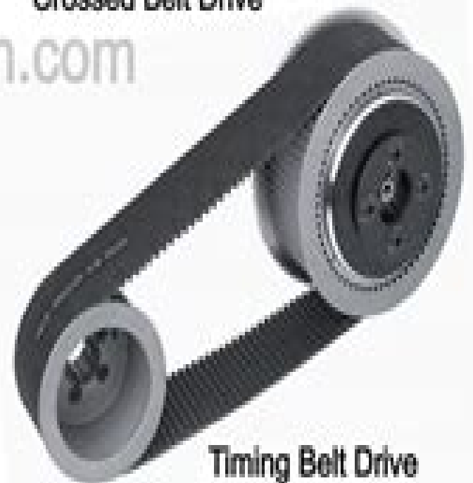
Timing Belt Drive