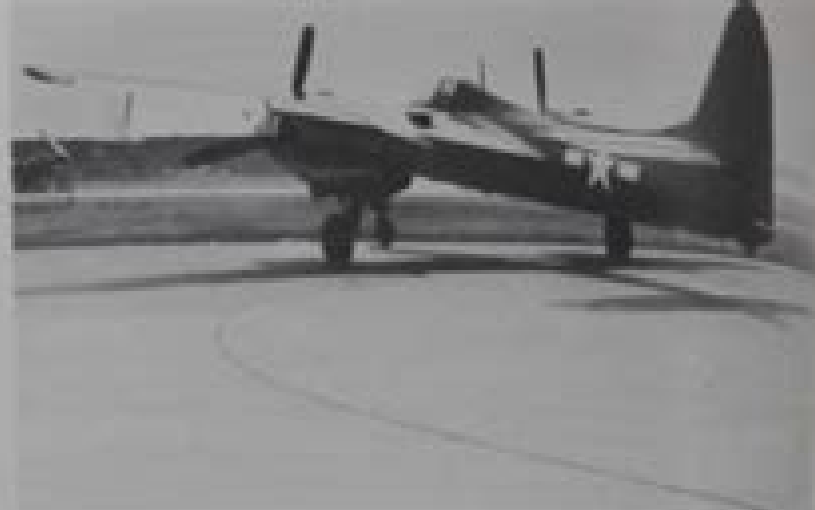
Fourth production F7F-1, BuNo 80262, was delivered 29 June 44 to the Navy for testing, Patuxent River. The windows aft of cockpit have been replaced by metal. The wing doors on the upper center wing section in front of the flap hinge are in the open position.