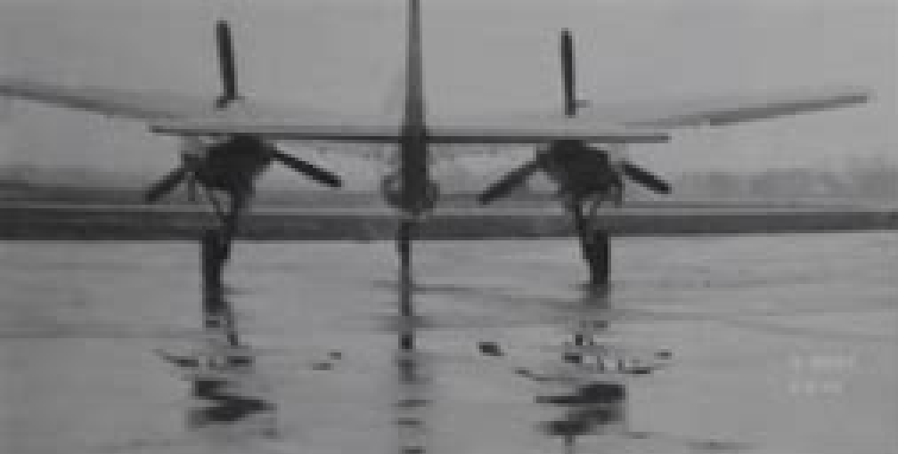
(Above) Tail view of the first production F7F, BuNo 80258, emphasizes slim fuselage and massive nacelles of the 2100 HP P&W Wasp Majors.