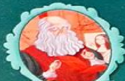
Leonardo da Vinci

"Thinking little leads to big mistakes."