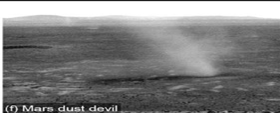
(f) Mars dust devil