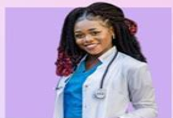
DR. PEACE HOST