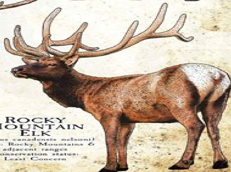
ROCKY MOUNTAIN ELK ( Cervus canadensis nelsoni ) Range: Rocky Mountains & adjacent ranges Conservation status: Least Concern