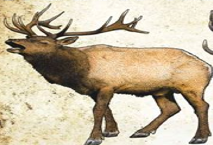
TULE ELK ( Cervus canadensis nannodes ) Range: Central California Conservation status: Vulnerable