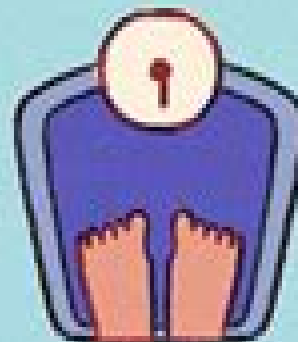
Sudden weight gain