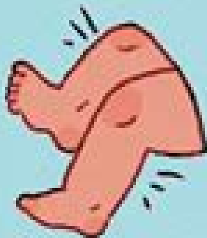
Swelling of legs, hands, and feet