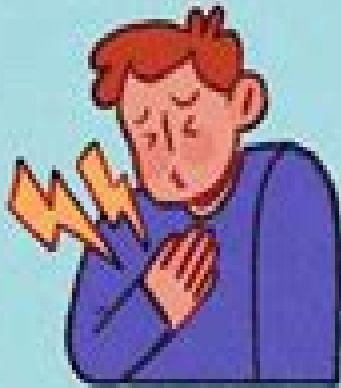
Chest pain (especially during exertion)