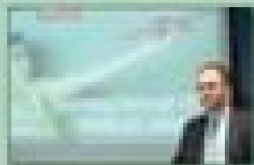
YECs are a global community of young entrepreneurs who are passionate about their work and their lives.

YECs are a global community of young entrepreneurs who are passionate about their work and their lives. They are the future of business and they are the future of the world.