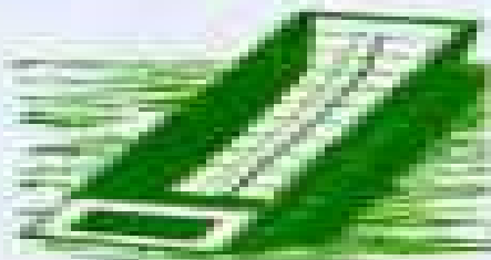
interior of horse