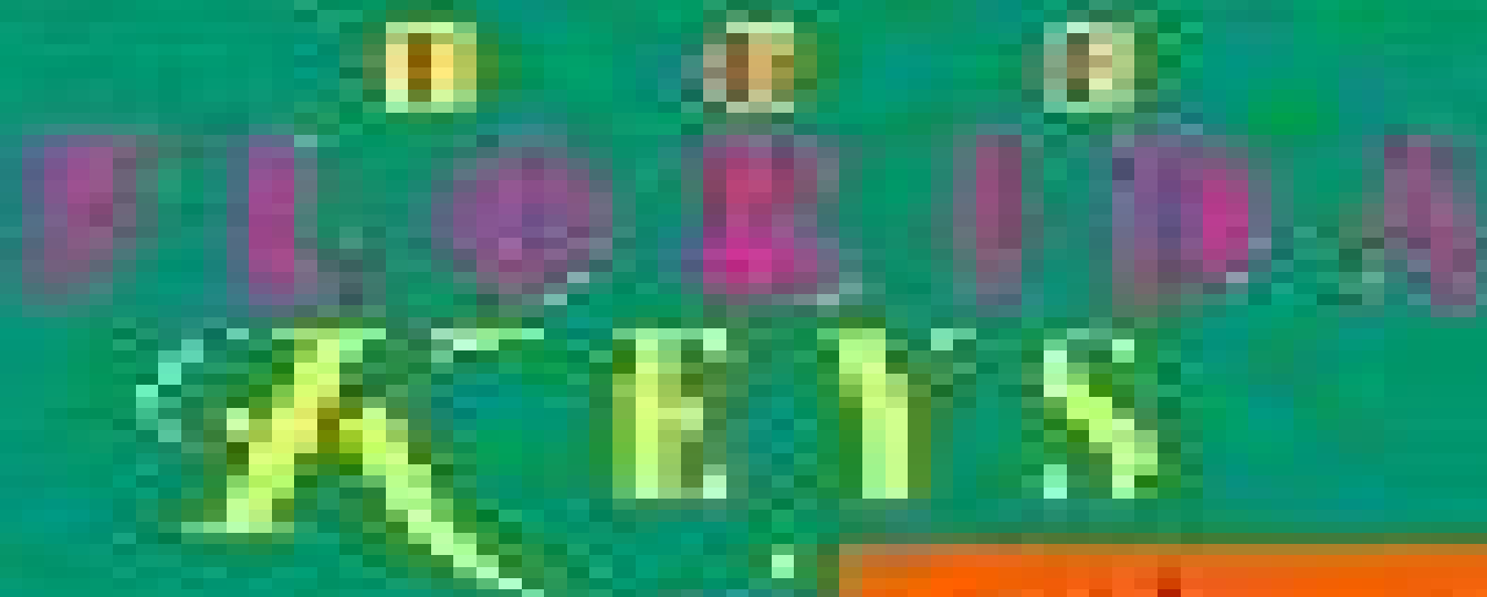
Three people in purple shirts and white pants standing in a row on a green field.