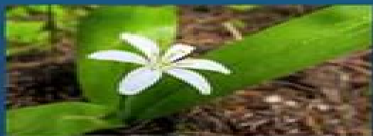
QUEEN'S CUP LILY