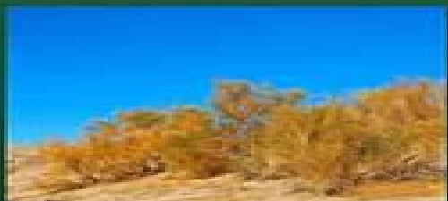
7. CALIFORNIA SAGEBRUSH (ARTEMISIA CALIFORNICA)