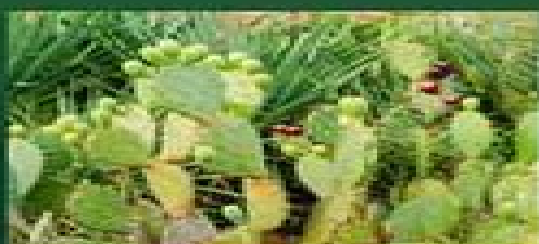
8. COASTAL PRICKLY PEAR (OPUNTIA LITTORALIS)