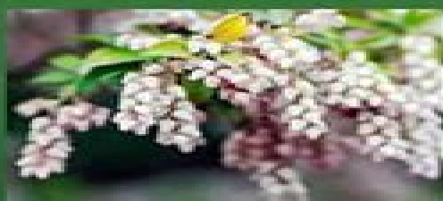
5. MANZANITA (ARCTOSTAPHYLOS)