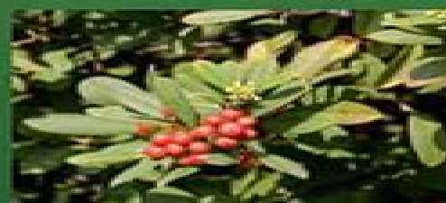
6. COFFEEBERRY (FRANGULA CALIFORNICA)