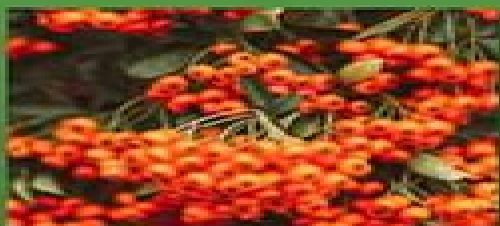
1. TOYON (HETEROMELES ARBUTIFOLIA)