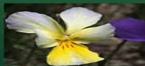
9. MOUNTAIN VIOLET (VIOLA PURPUREA)