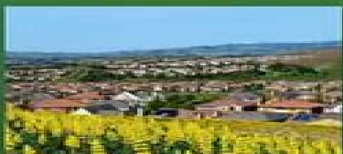
4. GOLDEN LUPINE (LUPINUS MICROCARPUS VAR. DENSIFLORUS)