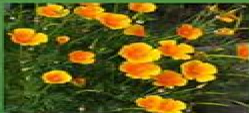
2. CALIFORNIA POPPY (ESCHSCHOLZIA CALIFORNICA)