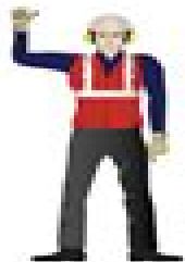
All clear (O.K.)