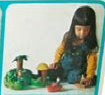
Hours of fun with Gilligan and friends.