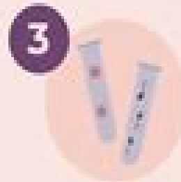
3 Egg and Sperm Preparation