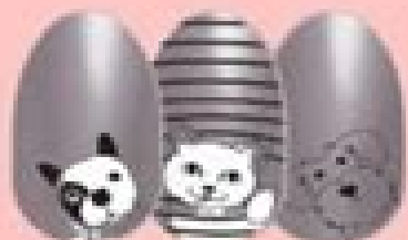
Berlin It To Win It